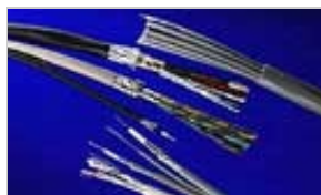
Wire & Cable